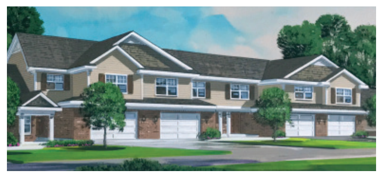
Dimensions are approximate. Builder reserves the right to change or modify floor plans.